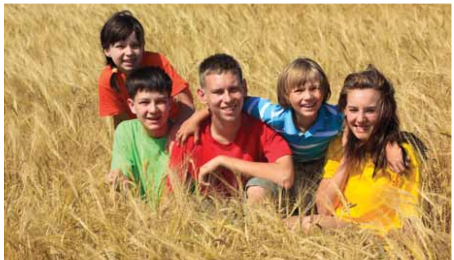
On the cover: CAFA is the nationally recognized organization for professional farm advisors and they can help you, no matter what your agricultural business is focused on. CAFA advisors maintain high standards while continually increasing farm advisory skills and knowledge intended to provide measurable value to their farm clients.